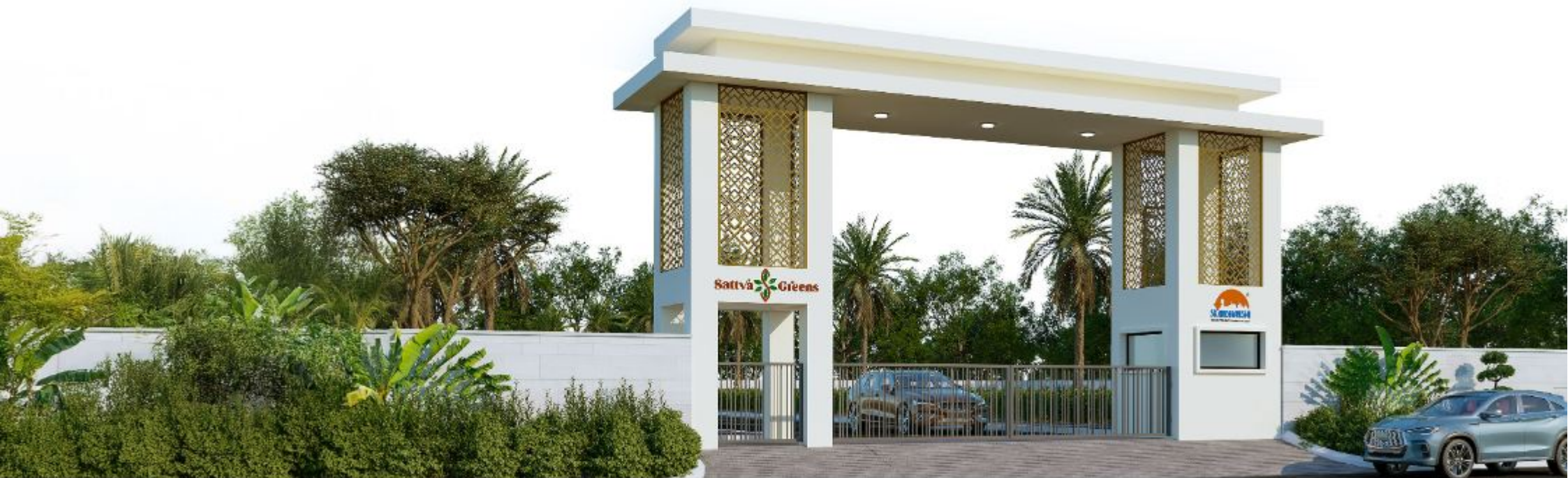
Our Residential Plotting Ventures @Ballari

Step into a world of pure investment and lasting value with Sattva Greens, a premium plotting venture by Skandhanshi. Designed for those who seek modern developments and a secure future, these residential plots offer exceptional growth potential. Whether you plan to build your dream home or invest for high returns, this is where purity meets prosperity. Own Land Today, Secure Your Tomorrow!